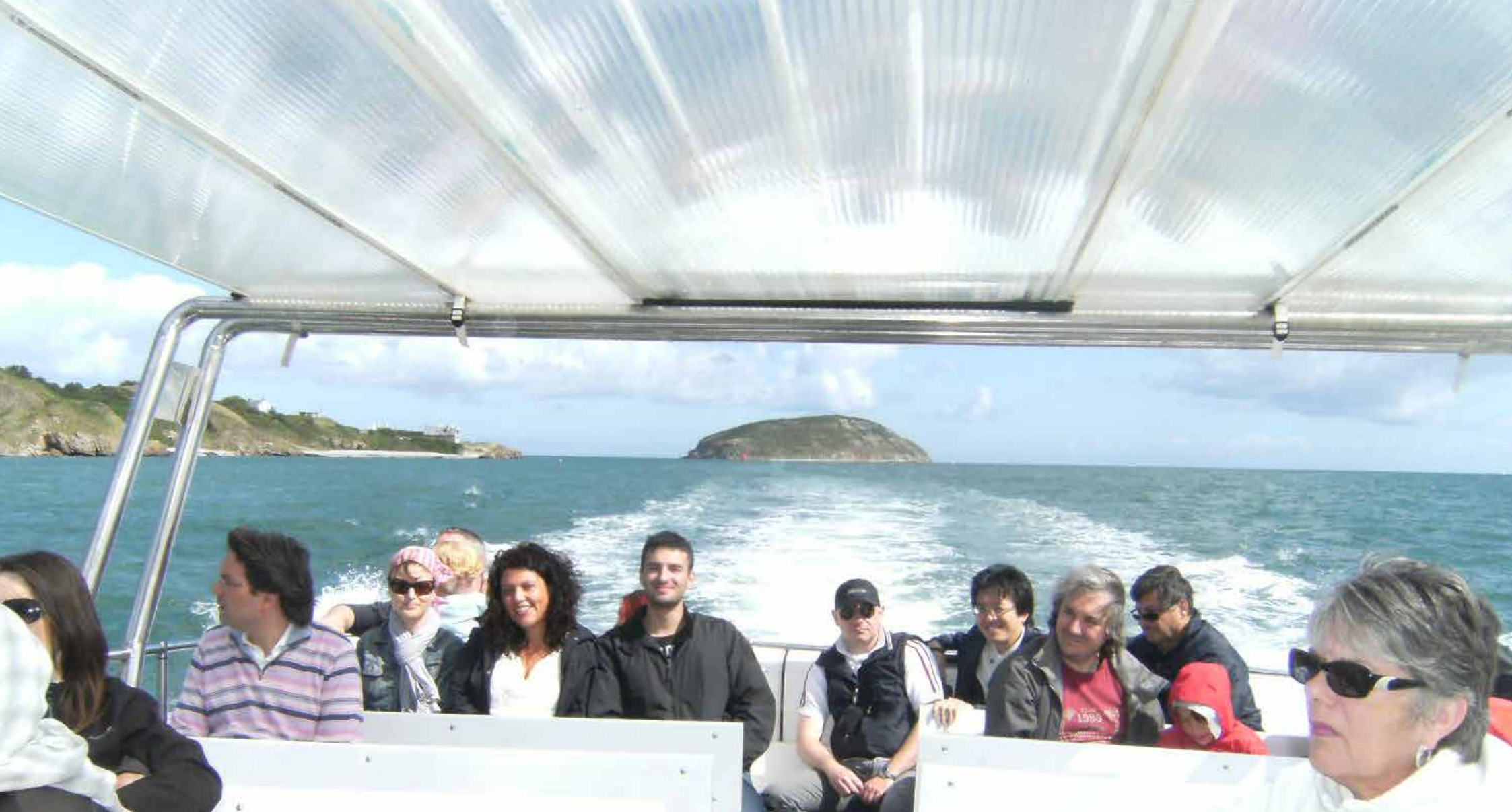
STUDENTS VISITING PUFFIN ISLAND BY BOAT IN 2011